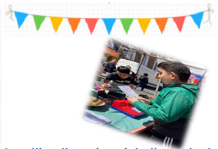
Inputting the prices into the calculator

The secondary department at KQ have run two very successful KQ market days in Portobello Road market.