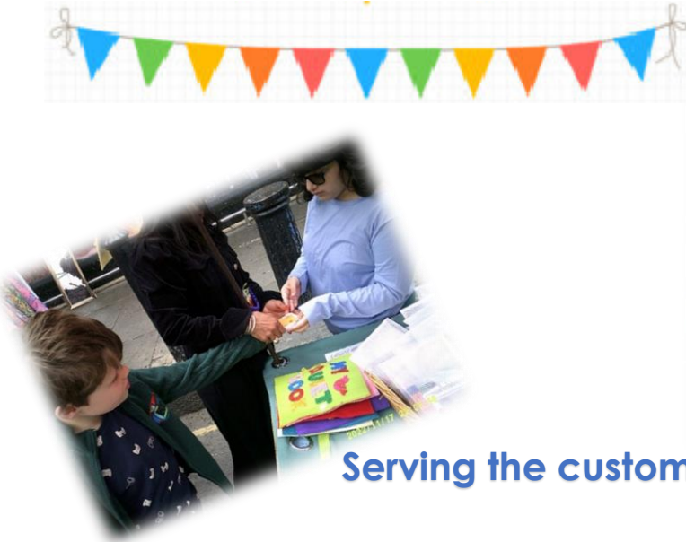
Serving the customer