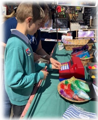
Calculating totals using the cash register