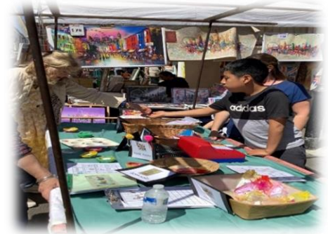
Interacting with members of the public